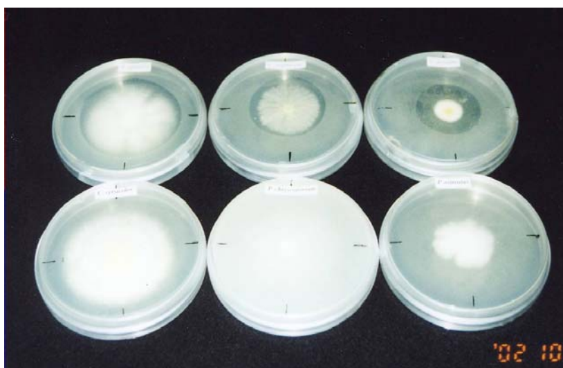
Figure 1. Growth of wood rotting fungi on copper containing plate. Upper row, brown rot fungi; bottom row, white rot fungi.

than others (at 1000 ppm). However the growth of white rot fungi, Coriolus versicolor and Phanerochate chrysosporium was very much inhibited by copper at 1000 ppm, which was not observed for all brown rot fungi tested. Interestingly, clear zone was observed surround the colony of the brown rot fungi when they were grown in Cu containing plate but it was not observed for the white rot fungi as we can see in Figure 1. The clear zone was only formed by brown rot fungi, which are widely known to produce higher amount of oxalic acid. Therefore, it is suggested that the metal ion in that zone was precipitated by oxalate the produced.